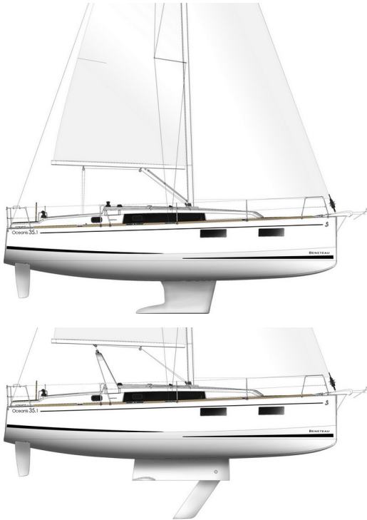
Sailing dinghy - Option: Arch