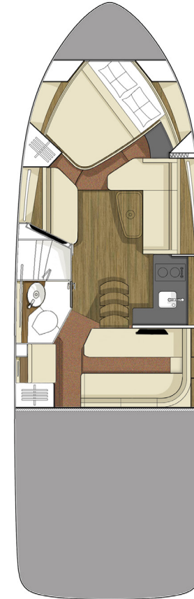
STANDARD CABIN LAYOUT