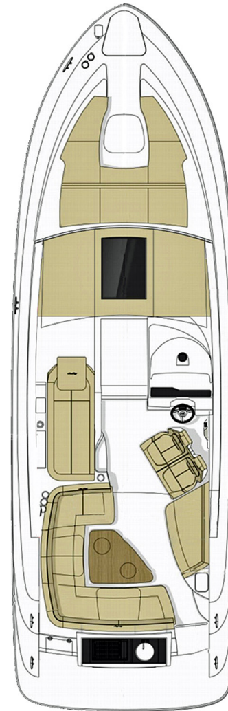
COCKPIT & DECK LAYOUT

NOTE: Some features and options may not be available when a boat is built for regions outside North America and/or has CE Certification. Boats ordered with 220V/50 cycle electrical systems will have the appropriate appliances in the corresponding voltage.