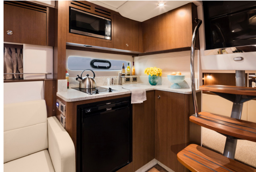
From the deluxe galley with ample storage to the solid-surface counter tops and recessed stove, the Sundancer 350 Coupe is fit for a top chef.