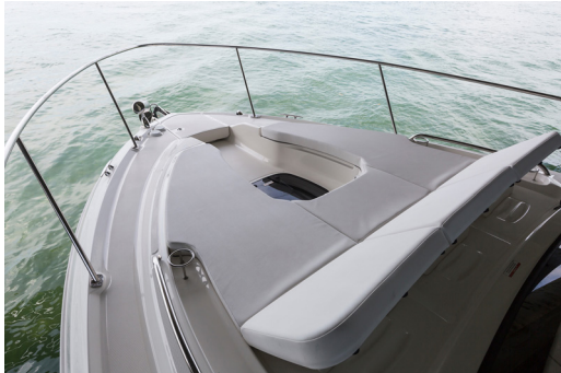
The Coupe foredeck features an enhanced bow seating configuration, adjustable & articulating backrest, cupholders and integral speakers.

Regardless of your destination, this spirited performer will get you there with enough class and fashionable flair to satisfy the most demanding guest. The 350 delivers refined luxury with a contoured Coupe fiberglass hardtop, ingenious Coupe foredeck seating, ample cockpit seating and amenities galore. The helm is designed to seamlessly integrate a range of standard and optional navigational gear, and eases control of the MerCruiser® engines or the optional Axis® propulsion system