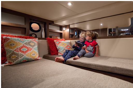
The luxurious, wood-trimmed mid-berth includes convertible twin beds that convert to a double berth w/slide-out base & dedicated filler cushions.