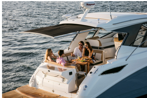
An optional cockpit retractable sunshade and transom Gourmet Station make for an inviting and comfortable social zone.