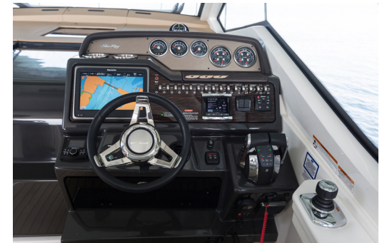
The well-designed, tiered helm station features standard SmartCraft® diagnostics and VHF Radio plus plenty of room for an optional Digital Dash w/Simrad® Radar/Chartplotter.