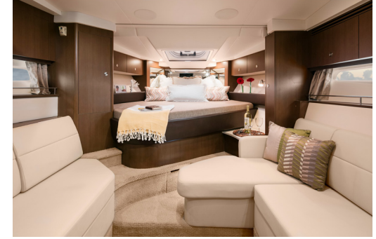
The 350's V-berth comes fully equipped so you can rest easy. The double bed is outfitted with neutral sheets as well as a luxurious memory-foam mattress.