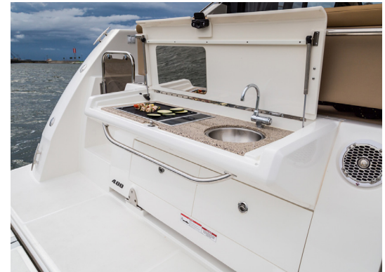
This optional gourmet transom space features a solid surface countertop with grill and sink.