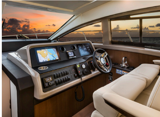
The fully equipped lower control station features SmartCraft™ diagnostics and VesselView display, plus a Raymarine® Axiom™ 12" radar/GPS/chartplotter or optional dual displays.