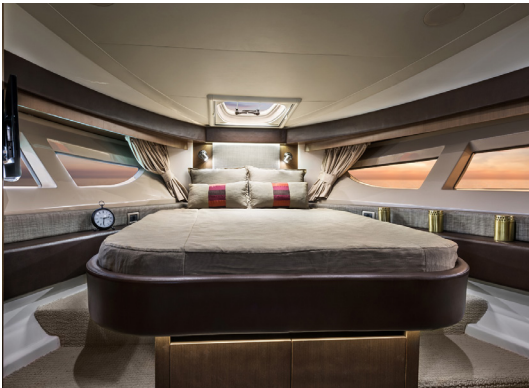
This handsome forward stateroom includes a double island-style bed w/Visco Elastic foam mattress & drawer storage below.