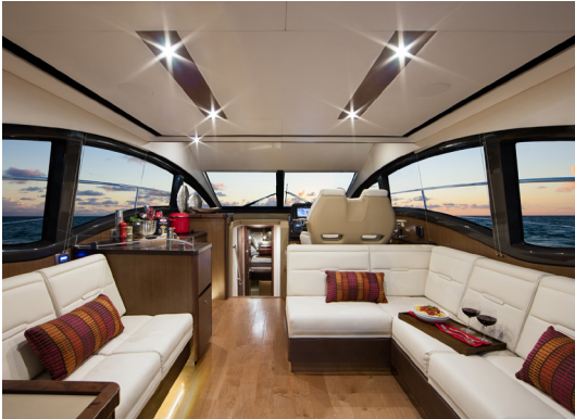
Large windows fill this elegant salon with plenty of light. Upgraded amenities include an optional plush sofa that converts to an extra guest bed.

The generous dimensions of this boat makes it exceptionally qualified for cruising and entertaining. A roomy interior with forward master, big mid-berth, and salon sofa can sleep five to seven people. Plus, there's a full galley and head, and a salon LED TV with Remote Blu-ray™ Player.