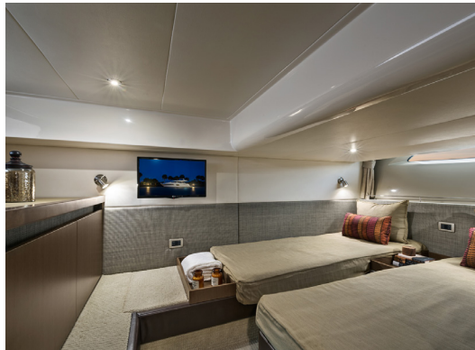
The convenient aft stateroom includes 3 twin berths with a sliding forward berth that converts to a larger bunk, or opt for additional storage (shown).