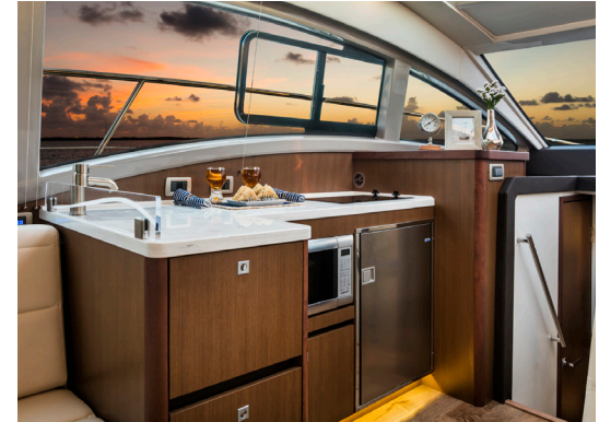
The galley is gourmet-ready, with stainless steel appliances, streamlined solid-surface countertop, fine wood flooring, and plentiful storage.