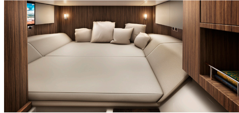
All-day boating is more comfortable than ever, and that comfort extends overnight. A spacious cabin gives boaters a place to get out of the elements with confident, assertive proportions and sophisticated finishes. This is no ordinary day boat: In the aft section, a queen-sized bed allows for overnighting.