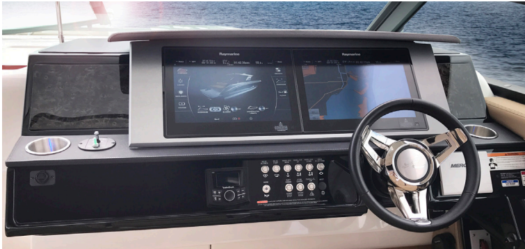
Innovative standards found throughout the SLX 400 Outboard include an advanced Digital Dash interfaced through standard twin 12" Raymarine glass displays and joystick Piloting for effortless docking and maneuvering in the tightest of spaces.