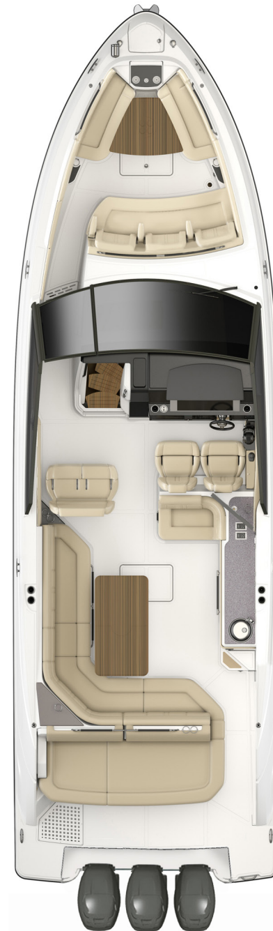
BOW & COCKPIT LAYOUT