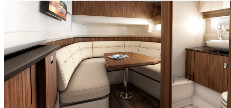
The forward bunk converts from a social gathering area to a wide bed to sleep additional passengers while an elegant enclosed head ensures comfort during extended outings.