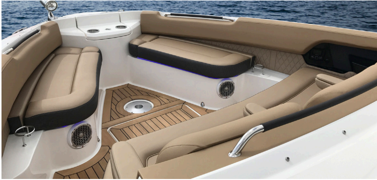
Redefining typical bow rider ergonomics, the deep bow Tour seating w/ fixed cushions, arm rests and stowable table helps everyone spread out..

Excellence is a product of intention. The SLX 400 Outboard delivers personalized sport boat excellence to its owner. An orchestrated system of systems, the 400 can be outfitted to achieve your expectations of excellence on the water. From colors, graphics and electronics, to the power that moves you, the 400 will be exactly the boat you want it to be. With Next Wave™ innovations throughout and exceptional style and performance, you couldn't pick a better boat.